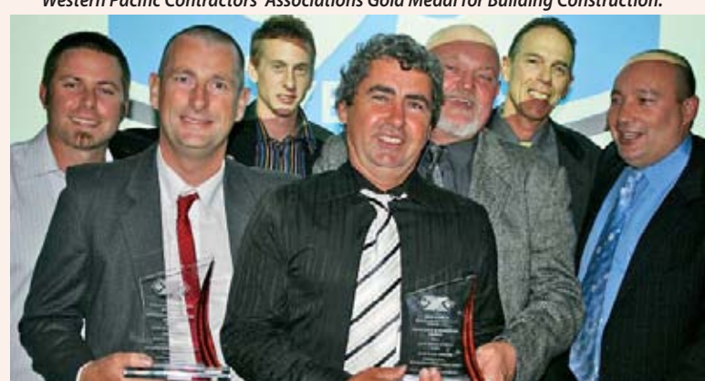
Hutchies' Internal Lining Division won the overall award for Best Commercial Project in Australia and New Zealand for the Emporium Hotel.